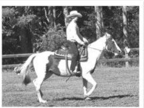
Lt. Horse Show