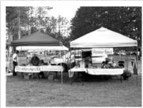
Vendors & Displays