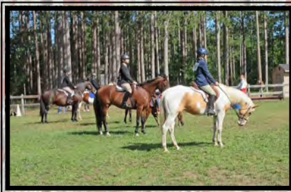
Lt. Horse Show