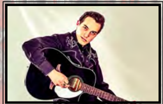
Johnny Cash Tribute